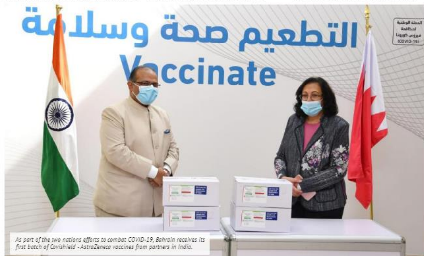
As part of the two nations efforts to combat COVID-19, Bahrain receives its first batch of Covishield - AstraZeneca vaccines from partners in India.