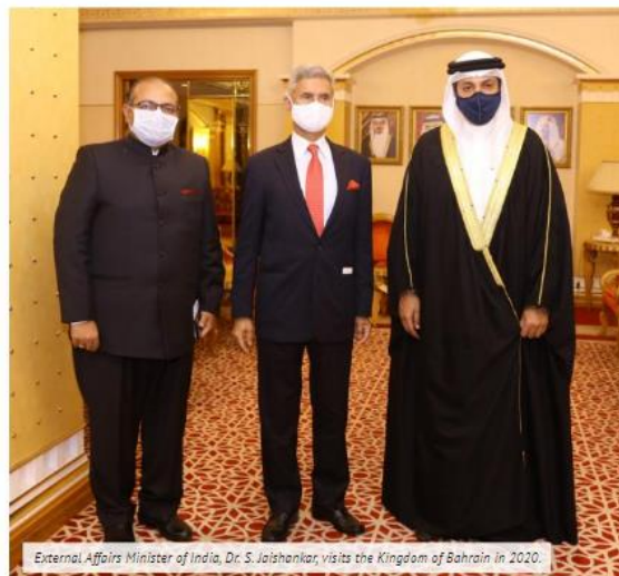
External Affairs Minister of India, Dr. S. Jaishankar, visits the Kingdom of Bahrain in 2020.

The embassy wishes to increase the cooperation between the two countries in the field of education in the years to come. "I am working with the concerned authorities on both sides to look into the possibility of a more active collaboration between the universities and students. A lot of universities have opened in Bahrain, and similarly, the education sector in India has developed to a great extent. A